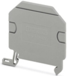
Partition plate, length: 53.4 mm, width: 2.2 mm, height: 45.7 mm, color: gray

Please be informed that the data shown in this PDF Document is generated from our Online Catalog. Please find the complete data in the user's documentation. Our General Terms of Use for Downloads are valid ( http://phoenixcontact.com/download )